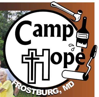
Westminster United Methodist Church